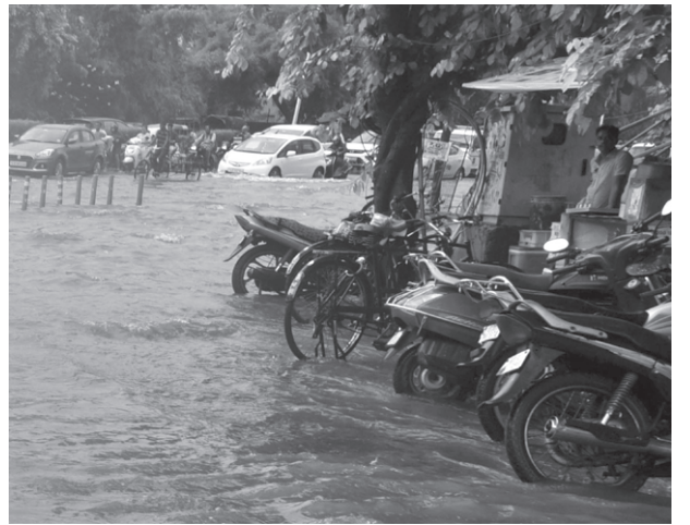
Heavy rain lashes Ahmedabad city on Wednesday. Waterlogging in several places.