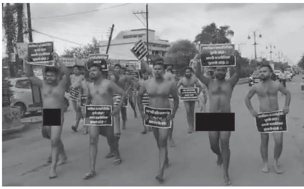
Protesters demanding the resignation of Chief Minister Bhupesh Baghel over the nude protest in Raipur.